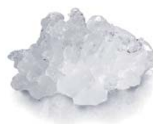
Residual water contents 25%

Ice in its most natural form, made at a temperature just below zero degrees Celsius, contains 25% residual water content, making it very moist. Its flake shape makes it extremely versatile and very simple to use effectively.