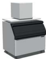
MF 36 + SB550 + KBT1 (sold separately)