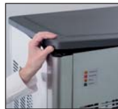
ABS plastic top cover