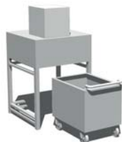
MF 36 + SIS300 (sold separately)